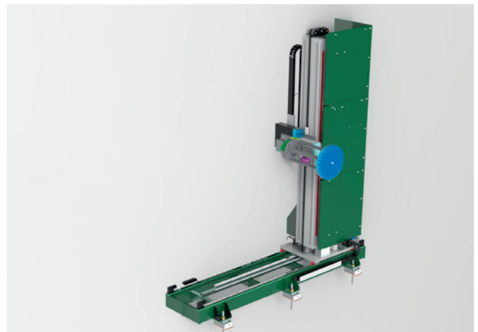
Planar Near-Field Scanner: front view